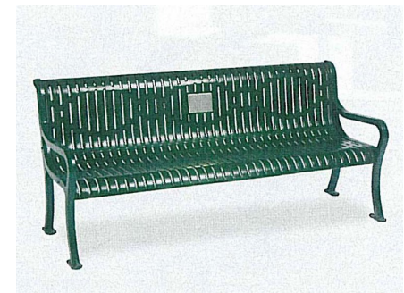
Benches may be engraved as lasting memorials.

All of these would make wonderful gifts. Trees, benches, and the patio seating may be dedicated with a plaque bearing your name or message of choice.